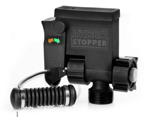
The Waterblock sensor