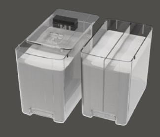
Scanomat SmartFridge with single or double milk container